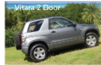
Vitara 2 Door