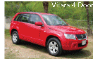
Vitara 4 Door